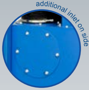
additional inlet on side